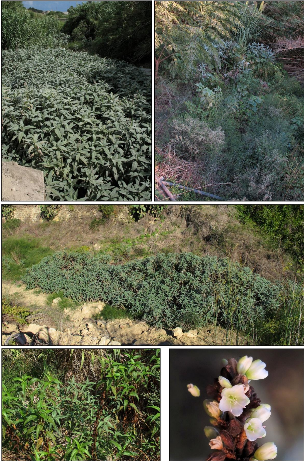
Figure 6: Populations of Persicaria lanigera in the Maltese islands. Top left: Wied il-Ghajj [PLA1] Marsascala, Malta (31-Aug-2006); Top right: Same population in 18-Sep 2011 to show its degradation down to 20-30 specimens; Centre: Wied Sara [PLA2]; Victoria, Gozo (3-Oct-2011); Bottom left: P. senegalensis , Wied Sara [PLA2] (3-Oct-2011); Bottom right: Whitish perianth of a metapopulation present at Wied il-Ghajj [PLA1] (18-Sep-2011). Flowers of another metapopulation (1A/1B) were pink.