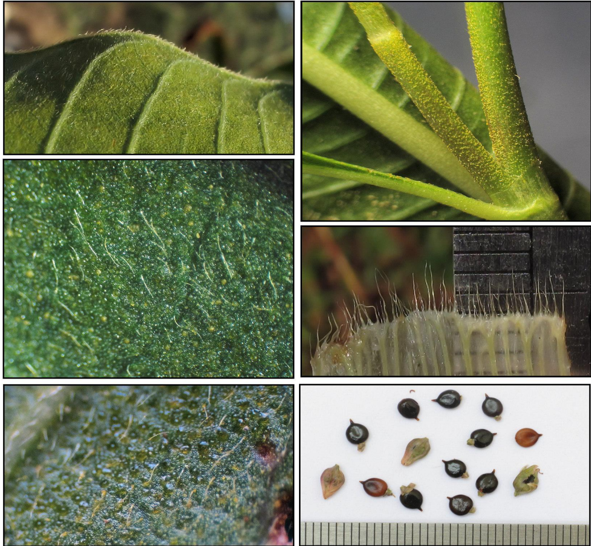
Figure 5: Morphological characters of Persicaria senegalensis forma albotomentosa found in specimens present on the Maltese Islands. Top left: Abaxial surface of lamina from [PGL2] having short white hair; Centre left: Magnified image (x40) of abaxial surface of lamina from [PGL1] showing scattered white hair, some yellow glands, and numerous translucent glands; Bottom left: same as above but material from [PGL4]; Top right: Peduncles from [PGL3] covered with sessile yellow glands; Centre right: ochreae from [PGL2] with a line of cilia 2-3mm long; Bottom right: Seeds from [PGL1] where some have dimpled faces.