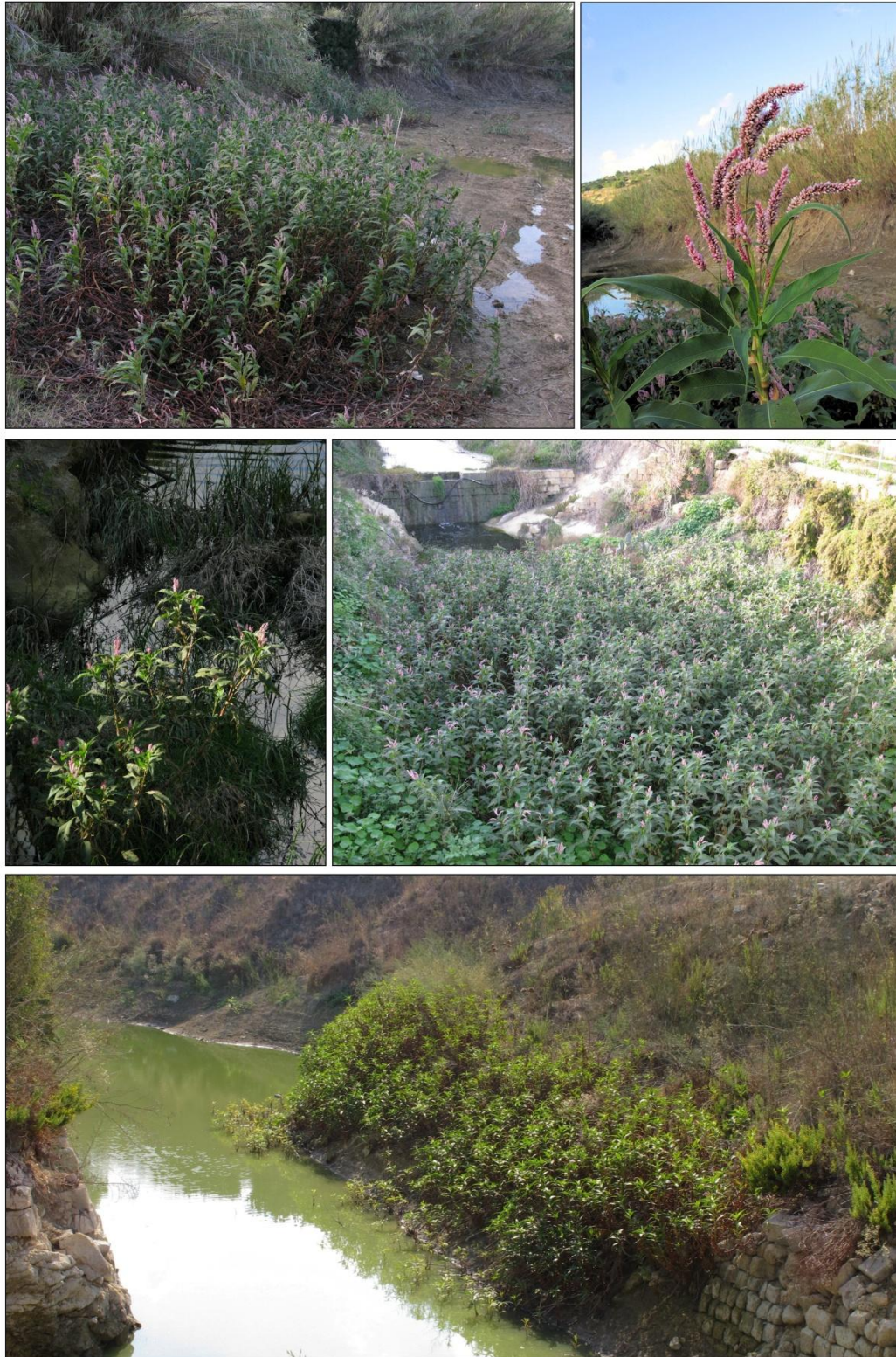
Figure 8: Populations of Persicaria senegalensis forma albotomentosa in the Maltese islands. Top Left: Wied il-Hżejjen [PGL1], l/o Mgarr, Malta (13-Dec-2009); Top right: Close up of inflorescence from Wied tal-Hżejjen [PGL1] (13-Dec-2009); Centre left: The only three specimens present at Wied tal-Grazzja [PGL4], Victoria Gozo (20-Jan-2008); Centre right: Same metapopulation observed almost two years later on (8-12-2009) showing the rapid colonisation of the species in shallowly flooded wetlands; Bottom: Wied l-Ort [PGL2], Ghasri, Gozo (3-Oct-2011)