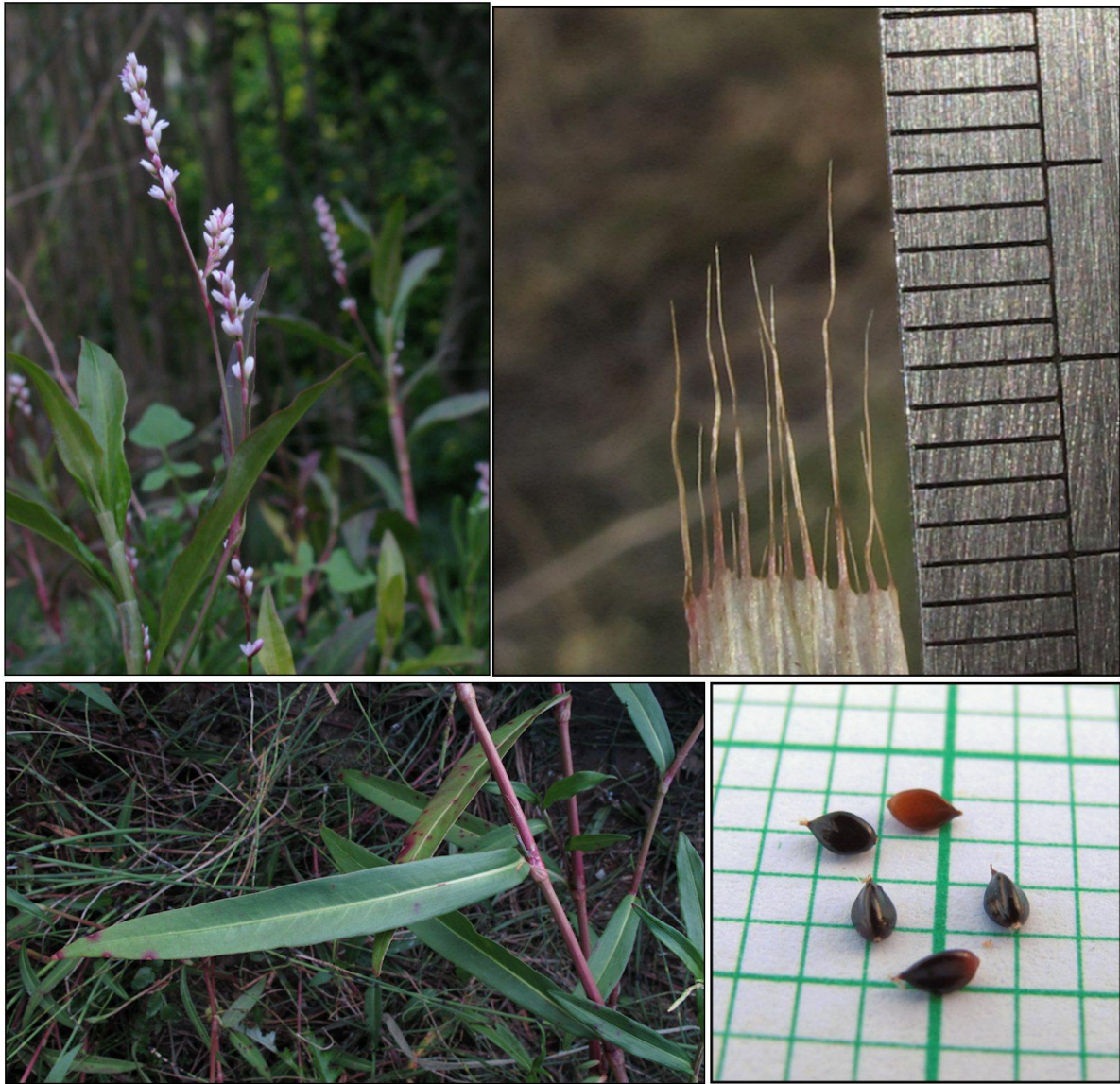
Figure 1: Morphological characters of Persicaria salicifolia found in specimens on the Maltese Islands [PSL1]. Top left: Narrow spike-form inflorescence with lax flowers; Top right: Margin of ochreae with long stiff bristles; Bottom left: Linear-lanceolate leaves; Bottom right: Trigonous, black seeds, c. 2.0-2.5mm long.