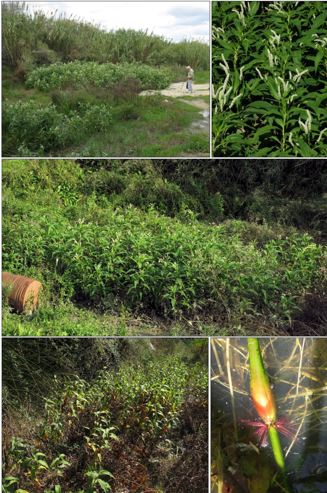
Figure 7: Populations of Persicaria senegalensis forma senegalensis in the Maltese islands. Top left: Wied Speranza [PSN2], Mosta, Malta (12-Dec-2009); Top right: Inflorescence from specimens at Wied Speranza [PSN2] (4-Nov-2009); Center: Wied ta' Brija [PSN1], Girgenti area, Siġġiewi, Malta (12-Nov-2008); Bottom left: Wied il-Ghasel [PSN3], Mosta, Malta (22-Sep-2011); Bottom right: Basal stem submerged in water with red roots at the base of the nodes taken from Wied Speranza [PSN2] (4-Nov-2009) .