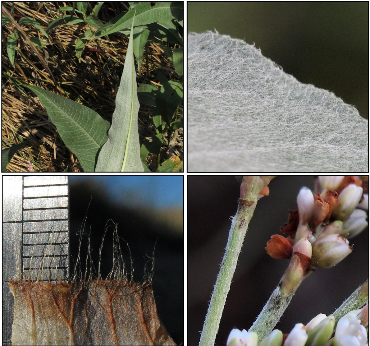
Figure 2: Morphological characters of Persicaria lanigera found in specimens on the Maltese Islands. Top left: Abaxial (left) and adaxial surface of leaves from Wied Sara [PLA2], Victoria, Gozo. Lower surface is more densely hairy and has a white appearance (3-Oct-2011); Top right: Close up of woolly indumentums at the abaxial surface of lamina from Wied il-Ghajj [PLA1], M'Scala, Malta (18-Sep-2011); Bottom left: ochreae lined with long shaggy cilia, about 5-6mm long from Wied Ghasri [PLA3] (11-Oct-2011); Bottom right: Peduncles covered with greyish-white short tomentose hair from Wied il-Ghajj [PLA1] (18-Sep-2011)