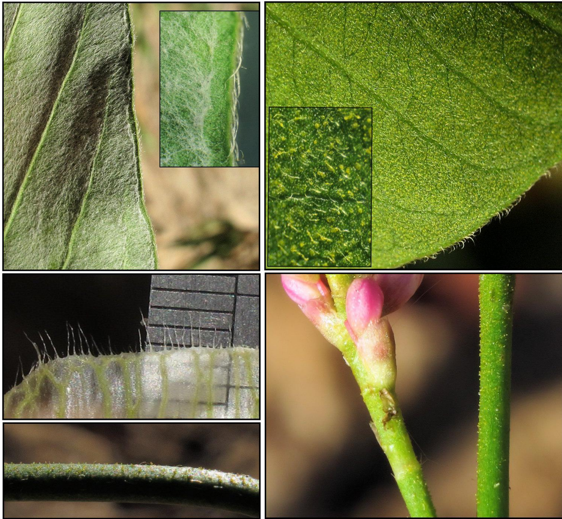
Figure 4: Morphological characters of Persicaria senegalensis forma albotomentosa found in specimens from the Maltese Islands. Top left: Abaxial surface of lamina from [PGL1] having a shortly tomentose indumentum with a close up of the margin in the inset; Top right: Abaxial surface of lamina from [PGL1] having a sparse short hair and yellow glands, better seen in the close up shown in the inset; Centre left: ochreae from [PGL1] with a line of cilia 2mm long; Bottom left: Close up of peduncle from [PGL1] showing sessile, bulging, yellow glands. Bottom right: peduncle from [PGL1] with sessile yellow glands;